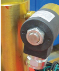
Models: CP 50025-2 CP 91225-2

Our Electronic solenoid valve is a normally closed valve requiring electrical energy to open. It is used to vent the pres-