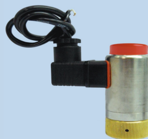
Latching Solenoid 24 VDC Model: CP 50026

the latching solenoid removed from the top plug adapter.