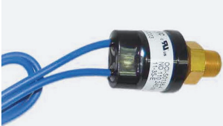
Models : CP 50138-2 (N.O.) CP 50138-1 (N.C.)

It monitors the pressure within the clean agent cylinder, indicates pressure loss, provides a signal to the extinguishing control panel when pressure drops to below 291±10 psig.