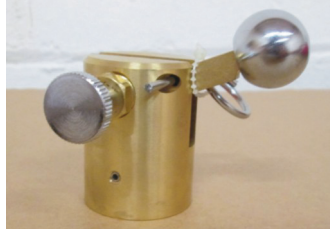
Model: CP 61033

It is used for manual actuation of cylinder, and made of solid Brass. It is self-venting with a safety pin to prevent accidental discharge.